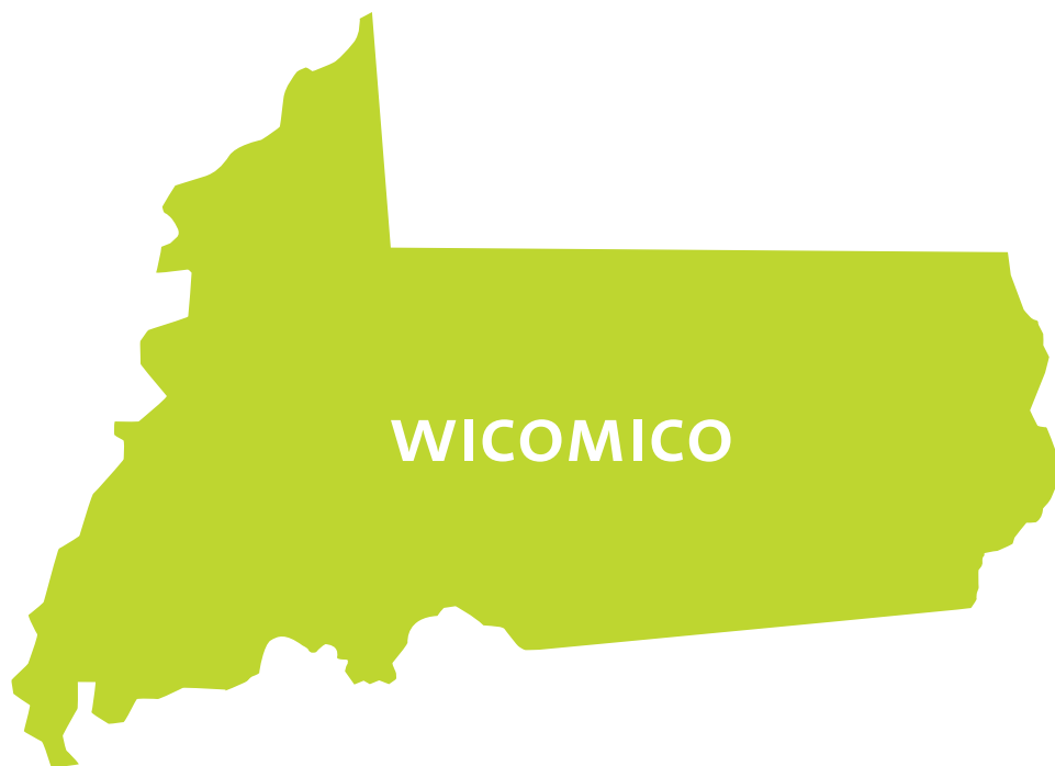
Hospital Visits for Chronic Dental Conditions among Adults in Wicomico County Maryland, Fiscal Years 2013-2016