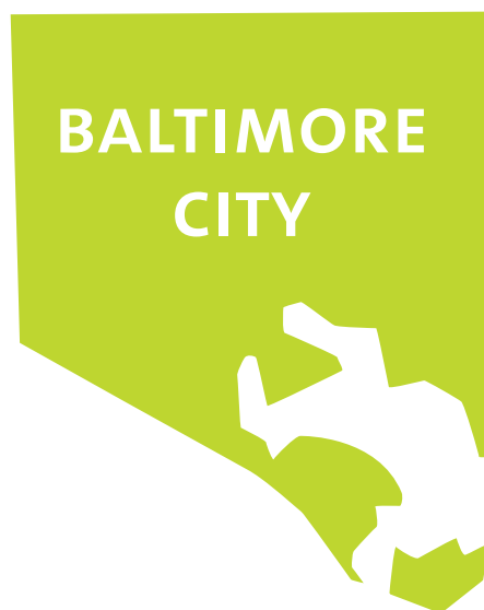
Hospital Visits for Chronic Dental Conditions among Adults in Baltimore City Maryland, Fiscal Years 2013-2016