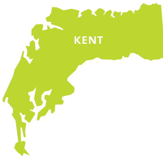
Hospital Visits for Chronic Dental Conditions among Adults in Kent County Maryland, Fiscal Years 2013-2016