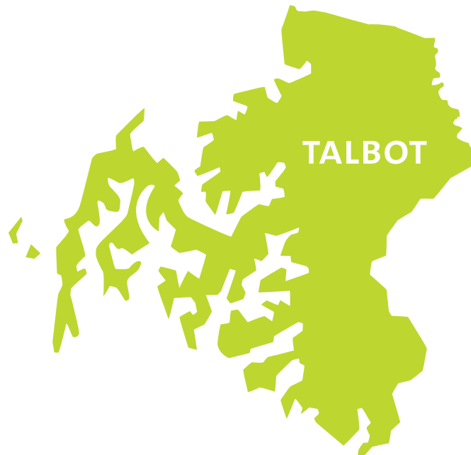
Hospital Visits for Chronic Dental Conditions among Adults in Talbot County Maryland, Fiscal Years 2013-2016