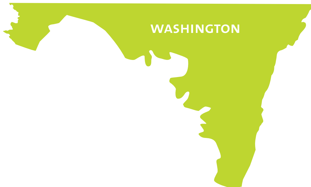
Hospital Visits for Chronic Dental Conditions among Adults in Washington County Maryland, Fiscal Years 2013-2016