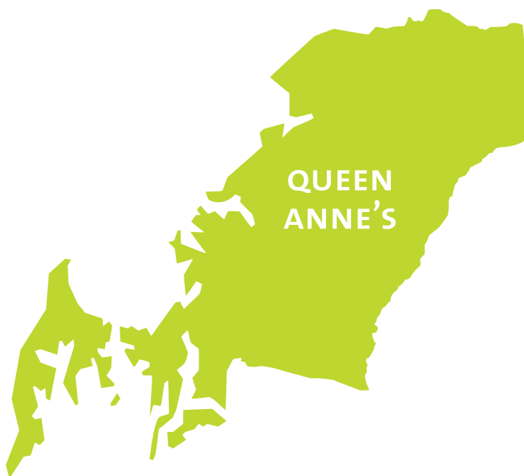
Hospital Visits for Chronic Dental Conditions among Adults in Queen Anne's County Maryland, Fiscal Years 2013-2016