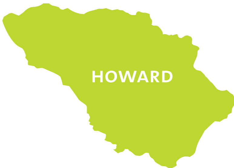
Hospital Visits for Chronic Dental Conditions among Adults in Howard County Maryland, Fiscal Years 2013-2016