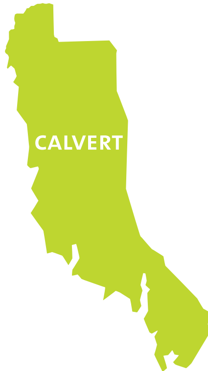
Hospital Visits for Chronic Dental Conditions among Adults in Calvert County Maryland, Fiscal Years 2013-2016