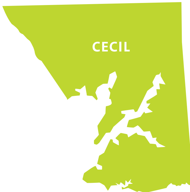
Hospital Visits for Chronic Dental Conditions among Adults in Cecil County Maryland, Fiscal Years 2013-2016