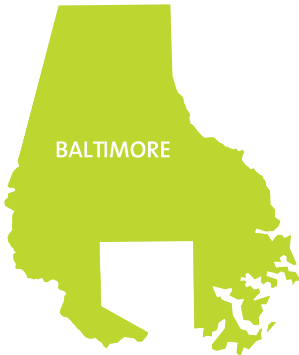
Hospital Visits for Chronic Dental Conditions among Adults in Baltimore County Maryland, Fiscal Years 2013-2016