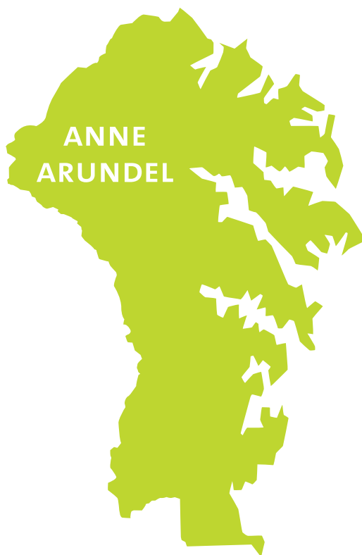
Hospital Visits for Chronic Dental Conditions among Adults in Anne Arundel County Maryland, Fiscal Years 2013-2016