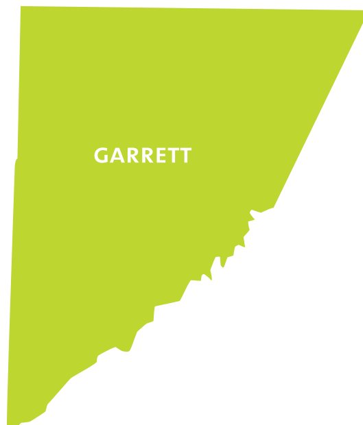
Hospital Visits for Chronic Dental Conditions among Adults in Garrett County Maryland, Fiscal Years 2013-2016