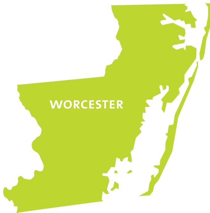
Hospital Visits for Chronic Dental Conditions among Adults in Worcester County Maryland, Fiscal Years 2013-2016