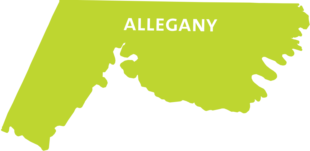
Hospital Visits for Chronic Dental Conditions among Adults in Allegany County Maryland, Fiscal Years 2013-2016