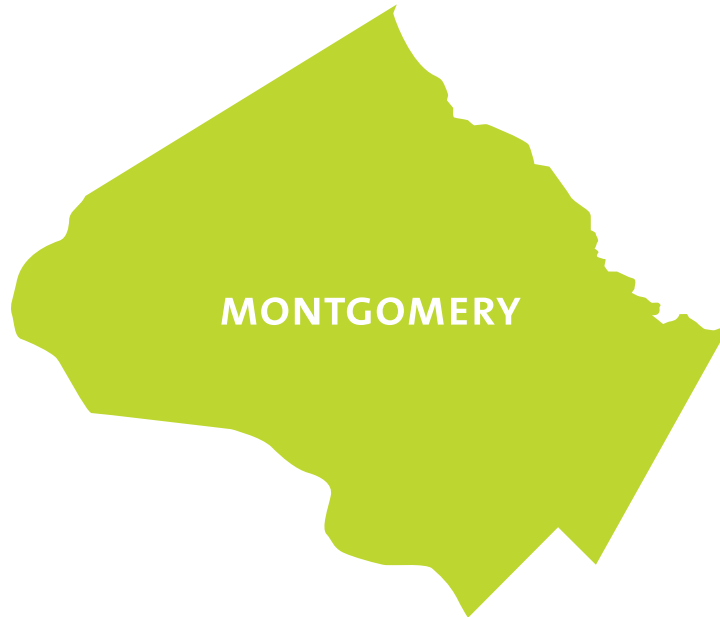
Hospital Visits for Chronic Dental Conditions among Adults in Montgomery County Maryland, Fiscal Years 2013-2016