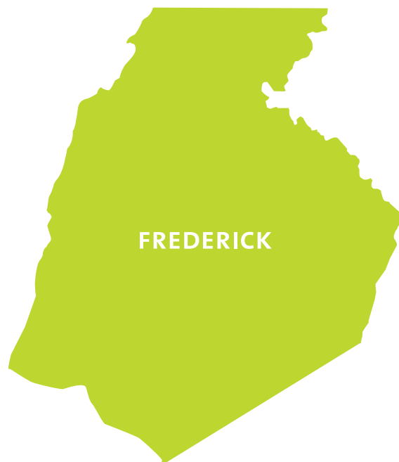
Hospital Visits for Chronic Dental Conditions among Adults in Frederick County Maryland, Fiscal Years 2013-2016