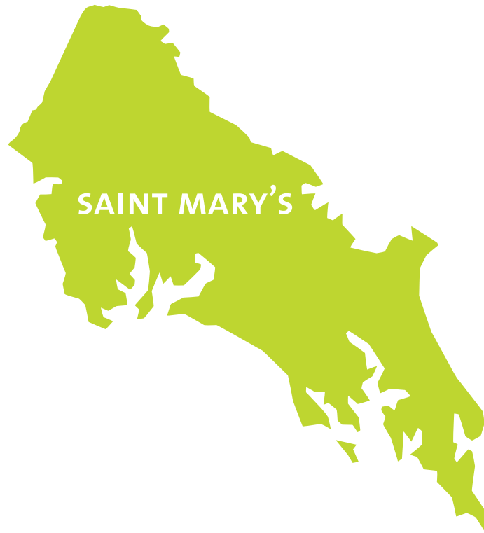
Hospital Visits for Chronic Dental Conditions among Adults in Saint Mary's County Maryland, Fiscal Years 2013-2016