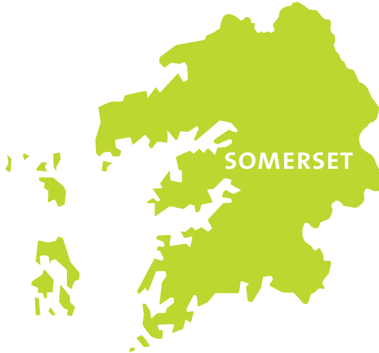
Hospital Visits for Chronic Dental Conditions among Adults in Somerset County Maryland, Fiscal Years 2013-2016