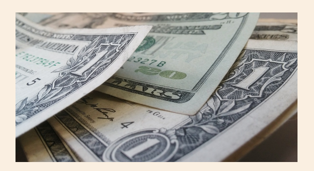
Give a little to make a big impact! Your gifts, both